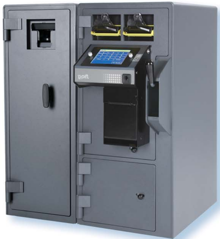
Shown with dual note validator (single available)